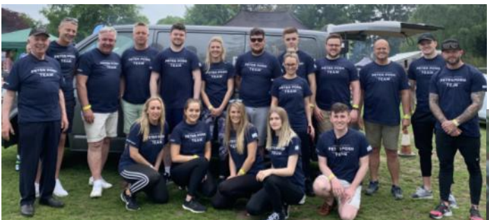
.....and above the orderly Peter Posh boat.