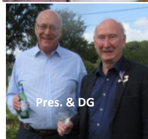
Pres. & DG