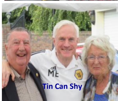
Tin Can Shy